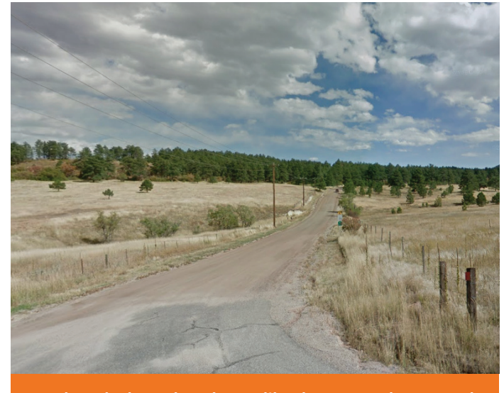
Local roads through Larkspur, like the unpaved Noe Road, are not designed to handle interstate or truck traffic. Town leaders report that cut-through traffic has increased substantially as travel delays on I-25 have worsened.